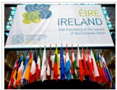
Irish Presidency of the Council of the EU