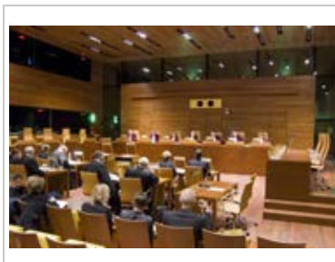
Chamber Hearing