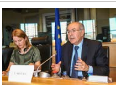
Vassilios Skouris, President