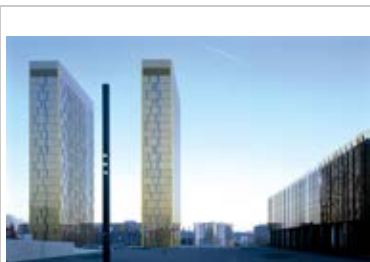
Concours with Towers & Ring