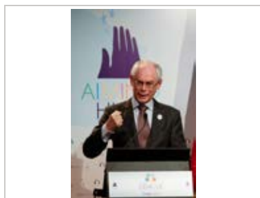
Herman Van Rompuy, European Council President