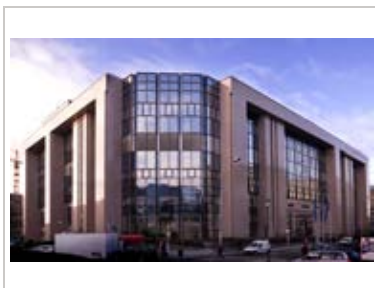
Justus Lipsius Building

HOME PAGE www.european-council.europa.eu