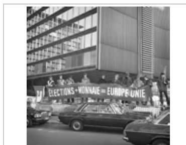
1977 Demonstration for universal suffrage and single currency