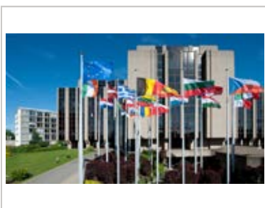
K1 Building