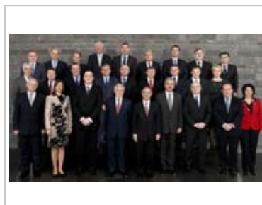
ECA members