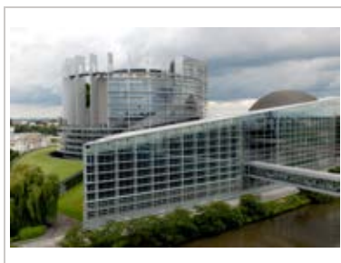
L. Weiss Building © EU 2013 and Architecture Studio