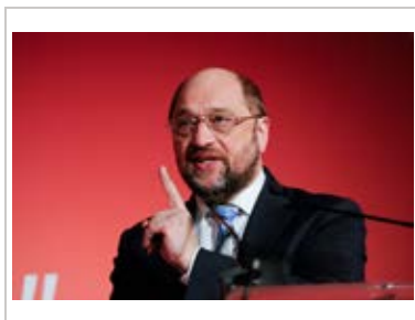
Martin Schulz, EP President