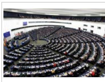
Plenary Session 2012